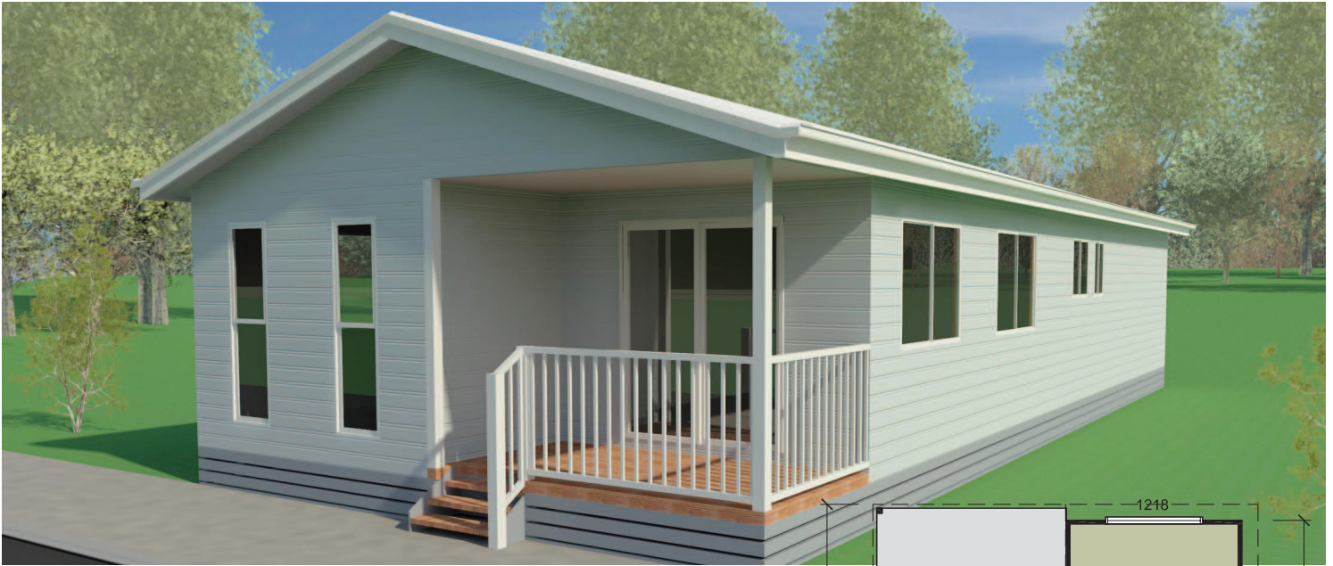
Artist's impressions only. Details and colours may vary.